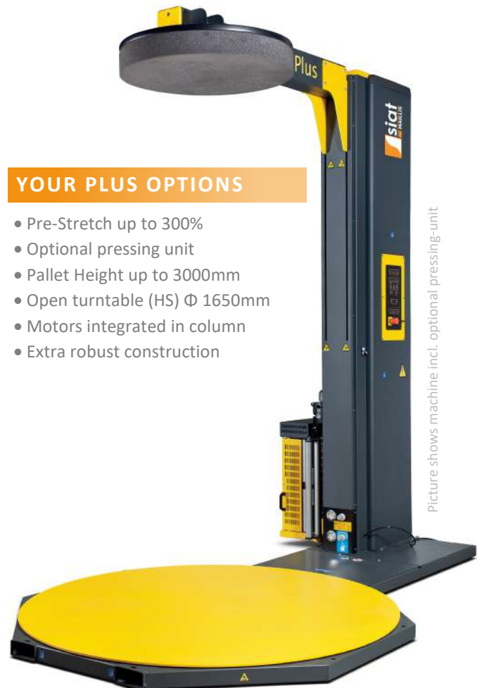
Picture shows machine incl. optional pressing-unit